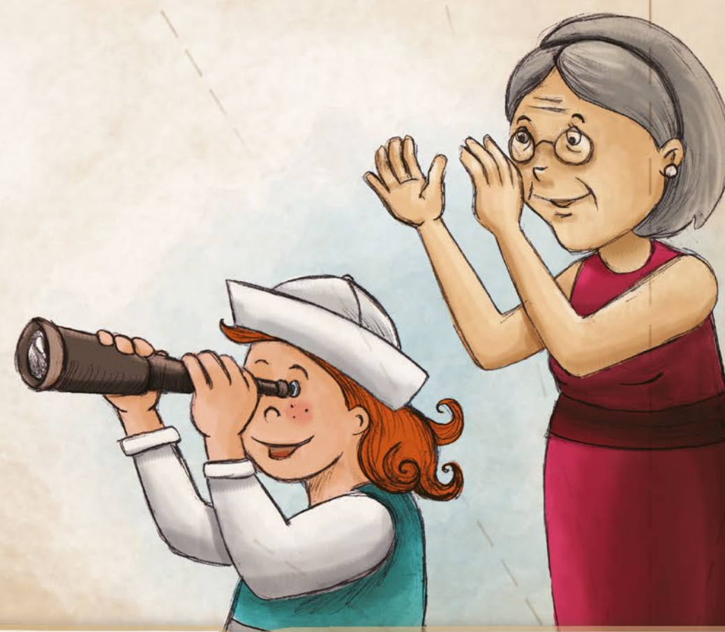
Illustration & design: Irène Lumineau

Inspired by Hanen Programs: It takes two to talk® and You make the difference®